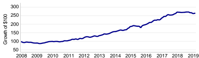
— AI Select Active Global Equity